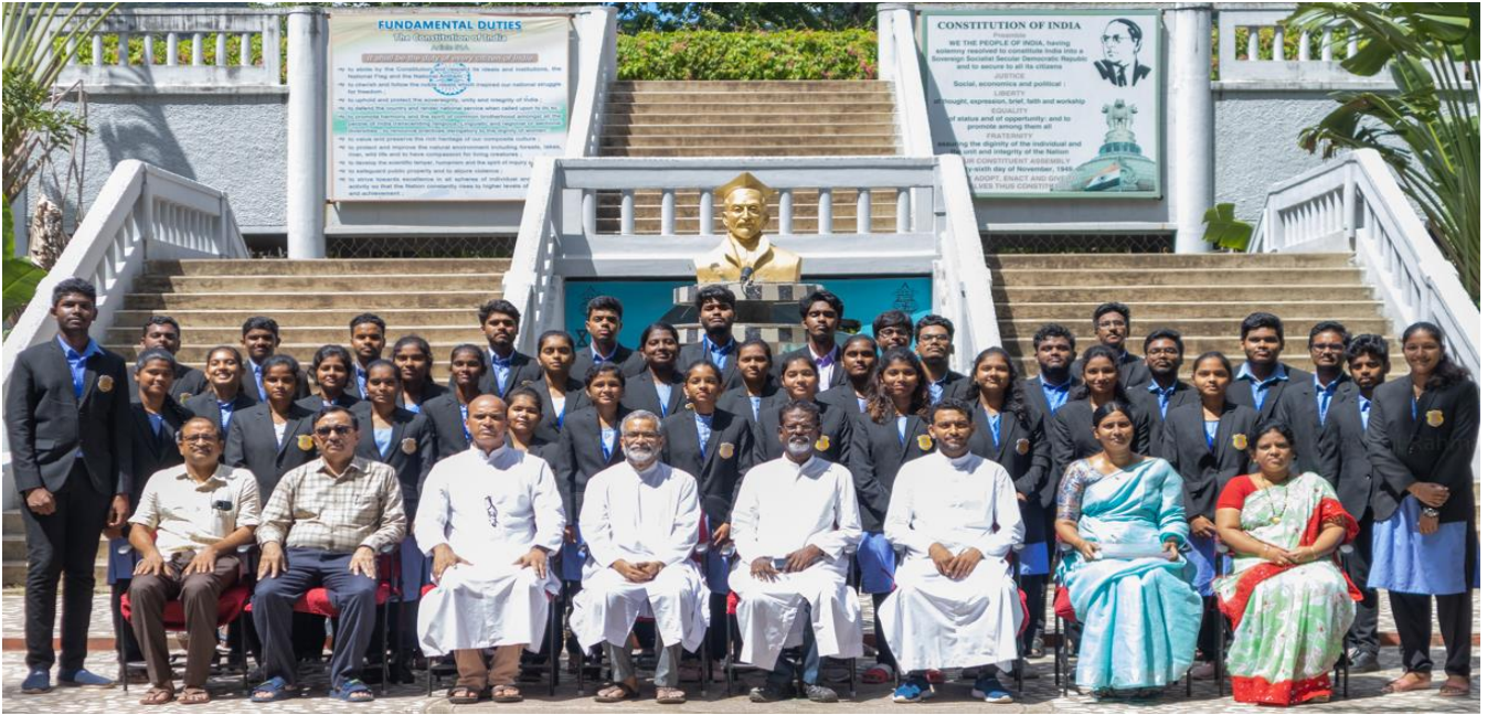
Student Council: 2022-23